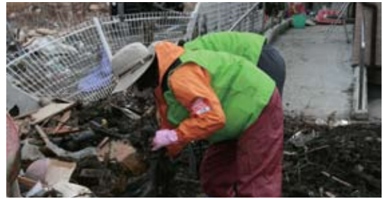
Clean up the wreckage