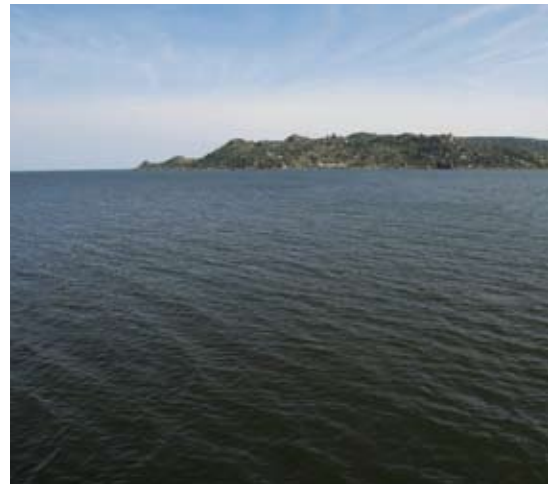
Lake Victoria View