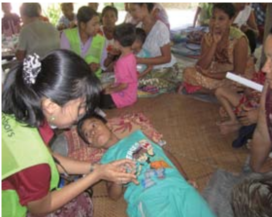
Conduct medical check up

As the saying goes, "Health is Wealth", and GN Myanmar will not only try to support community development, but also try our best to build a healthy environment in Bogale.