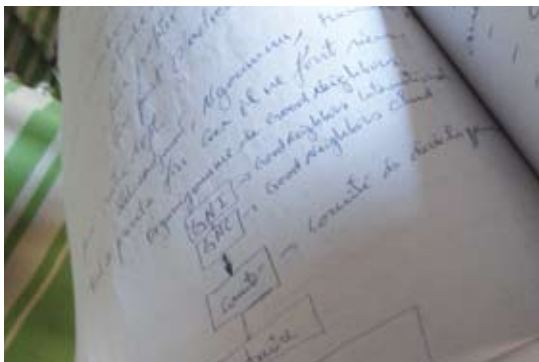
Report on volunteer work

In spite of the difficulties we volunteers are facing, I would like to encourage volunteers to persevere and keep on going. I am sure we will not work as volunteers our entire lives, so while we are doing volunteer work, we must do our best with love and enthusiasm. Also, we have the biggest responsibility to begin volunteer work when given to us, because it’s the beginning of the development in our community. Finally, I want to say thank you to GNI and greet all my volunteer colleagues all over the world.