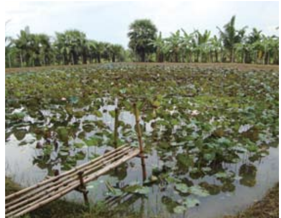
Water pond surrounded by fences which supported by GN Myanmar

balanced diet, dengue fever prevention and importance of personal hygiene. We conducted training about hygiene and it covered: 1)Washing hands before eating food and cutting nails to keep their hands clean. 2)Cleaning environment to reduce access of flies. 3)Drinking boiled water and 4)keeping a clean toilet. Through this education, GN Myanmar hopes that the community people have a better understanding and more knowledge about the importance of hygiene and health care.