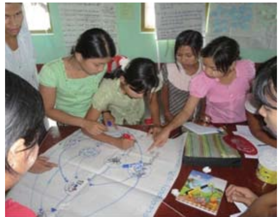
Conduct health prevention deucation