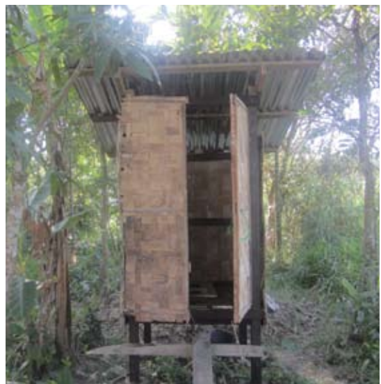
Toilets built by GN Myanmar's support

Moreover, GN Myanmar is making efforts to improve the health status of Bogale in many ways. We supported 3,290 children to get medical checkups and operate primary health care and hygiene training with doctors and nurses to 3,000 community adults. GN Myanmar has been conducting health prevention education about