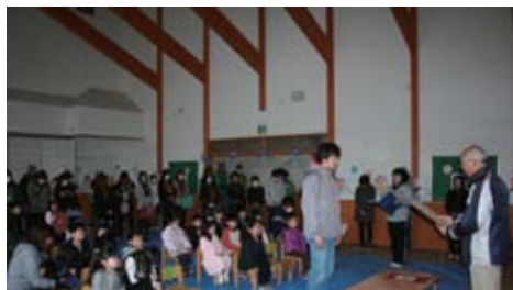
Father received the graduation certificates instead of his killed child

2 out of 27 graduates were killed in the disaster. The fathers of the 2 children received the graduation certificates instead of their child. The head of the nursery spoke kindly and wholeheartedly to the attending children, "It was really scary, wasn't it? You ran a lot, didn't you?" and explained to them that their two friends were taken to God's house and they didn't have to suffer anymore.