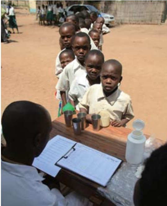
Distribute medicines to the Children

In addition to supplying safe-drinking water, GN Tanzania has built 21 new wells (2011. June), and has developed educational material on the prevention of schistosomiasis and helminth as well as conducting preventive education programs for local people. Moreover, on March 10, 2011, GN Tanzania, Korea International Cooperation Agency (KOICA) and (Tanzania) National Institute for Medical Research (NIMR) cooperated to open the world's first Mwanza NTD Clinic.