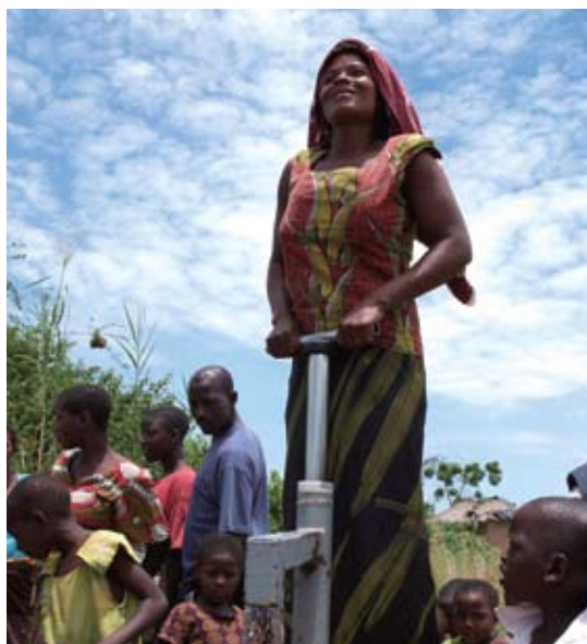
Community people using new wells

people keep using the water from Lake Victoria which is already contaminated with schistosomiasis. One dose of anthelmintic will not be able to exterminate schistosomiasis; therefore it has to be resolved through its fundamental problem. GN Tanzania cooperated with local representatives, schools, and Tanzanian government to give out anthelmintic and worked on to assist 7 million NTD infectious people back to health. There has been an effort made to lower the schistosomiasis infection rate from 50% to 10% by 2013. In