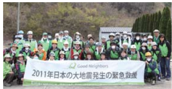
GNJP staffs and volunteers

After a request from the Disaster Volunteer Center in Otshchi, Good Neighbors sent volunteer coordinators to manage the daily activities and operations of volunteers to ensure we were working as efficiently as possible. As a result, volunteers throughout Japan were able to take charge of important tasks needed after we worked to place the right talent in the right roles. We have also been coordinating volunteers online.