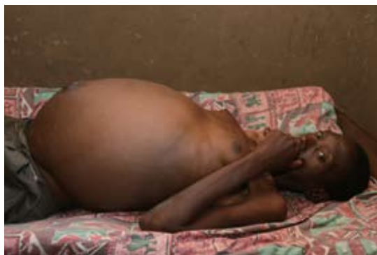
Stomach infected with schistosomiasis has begun to swell