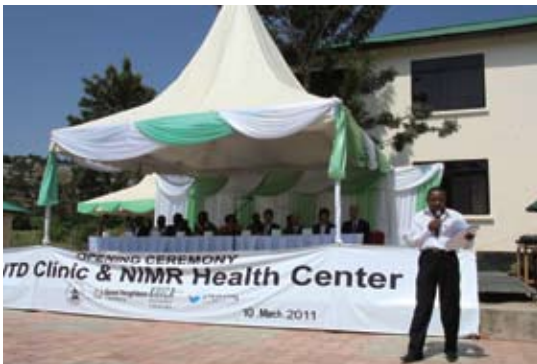
Opening ceremony of the world's first NTD Clinic & NIMR Health Center

In opening ceremony, there were many internal and external participants including the president of GNI, senior executive officials of Tanzania and Health researchers. It shows that the NTD clinic is the most needed in Mwanza area. GN Tanzania hopes that through its activities to keep our children secure future.