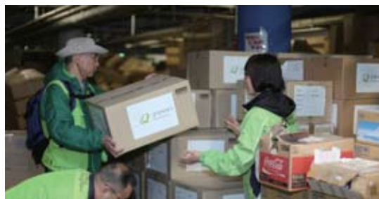
Aid relief workers giving out supplies

Good Neighbors researched the most urgently-needed supplies, cooperated with the emergency disaster control office in Iwate, and distributed the emergency relief supplies to Kamaishi-shi, Otshchi-cho, and Yamada-machi, with the majority of donations coming from enterprises in Korea, USA and Japan.