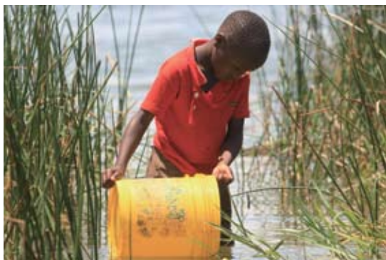
Water of Lake Victoria has been used to daily and drinking water