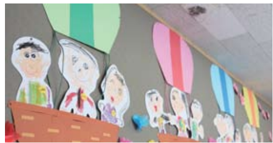
Children's painting be posted in evacuation center