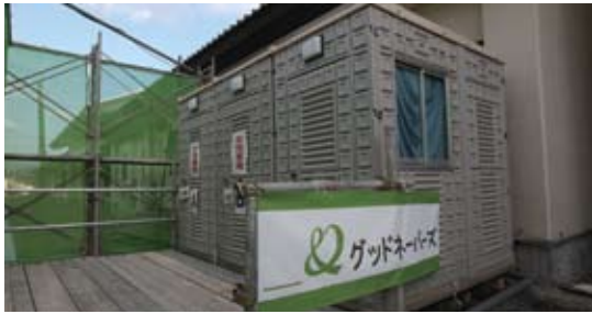
Shower booths were installed