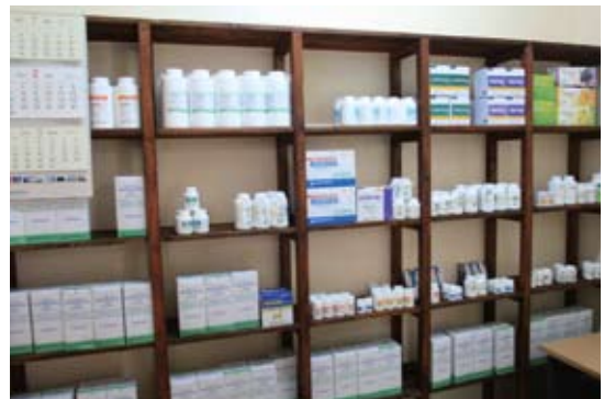
Inside the NTD Clinic

Good Neighbors Tanzania (GN Tanzania) > Registered officially as an International NGO in the Tanzania government since 2005 and actively working. To improve poverty, unhealthy sanitation environments, and poor societal infrastructure, GN Tanzania is facilitating local development projects in five different regions. Especially Korean professional medical team and local agencies are cooperating together in Mwanza on NTDs Project and making efforts on eradicating diseases through improvement of environment and education.