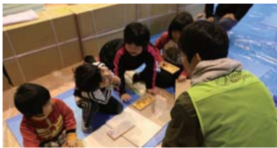
Children participate in an art program

Good Neighbors is helping counsel children from the aftershock of the earthquake and tsunami and during their current unstable living situation. We visited damaged schools and nurseries in Kamaishi, Otshchi and Yamada, researched what was needed, and collected the necessary goods and support the children needed. Also, Good Neighbors has been building a network of professionals in order to create a psychotherapy program for children suffering from PTSD (Post Traumatic Stress Disorder), and working with kindergarten and nursery teachers. Also, we've created a Mental Health Support Project as a recreational activity for middle and high school students.